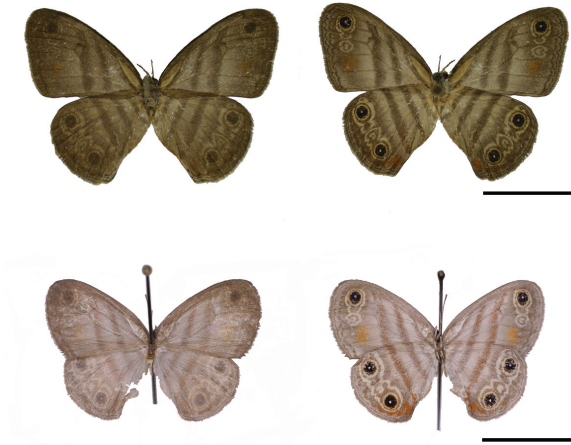
Figure 1. Euptychia juanjoi sp. nov. Top row (dorsal view on left, ventral view on right): male holotype with labels; bottom row (dorsal view on left, ventral view right): female allotype with label. Scale bar = 10 mm.

MUSM — Museo de Historia Natural, Universidad Nacional Mayor de San Marcos, Lima, Peru